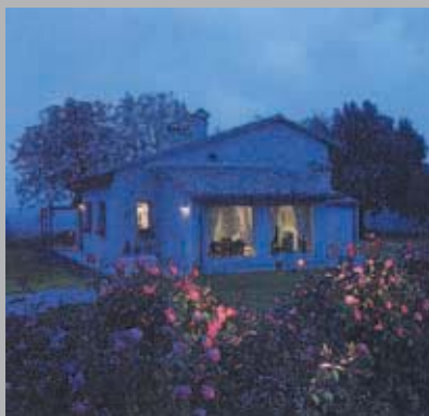
The Alfa Sprint is ideal for the needs of the modern family.