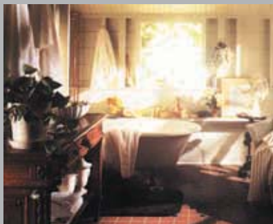
It is ideal when a bath and a shower are taken simultaneously.

Whenever the convenience of a single unit giving both heating and an abundant supply of domestic hot water is needed.