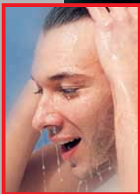
The relaxation of a hot shower...