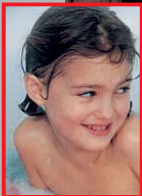
...the joy of children in the bath.