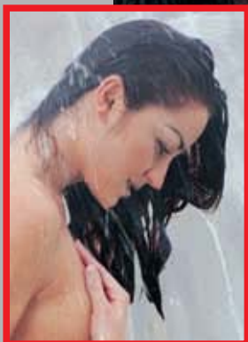
...the benefits of hydromassage...